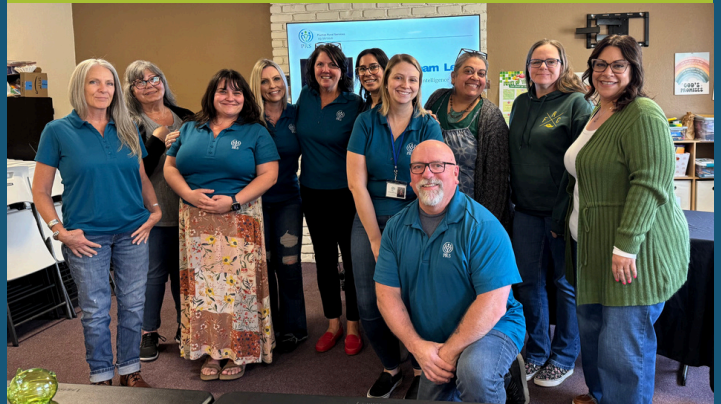
Lunch Learn Lead Training, May 28, 2026