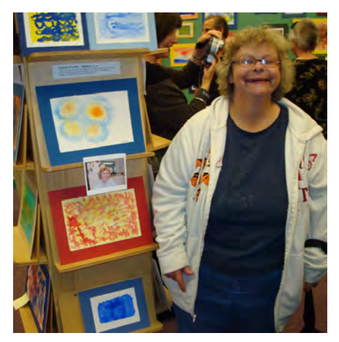
ALIVE Art Exhibit at Epilog Books

ALIVE can assist you in finding affordable housing. You will learn to live on your own and how to make your home safe and comfortable.