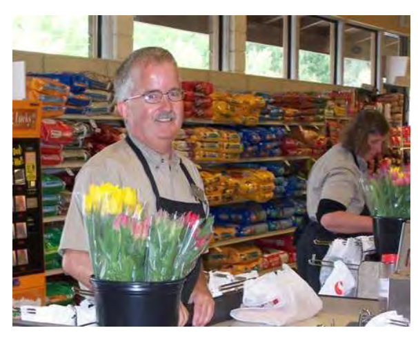
ALIVE Employment Service at Work